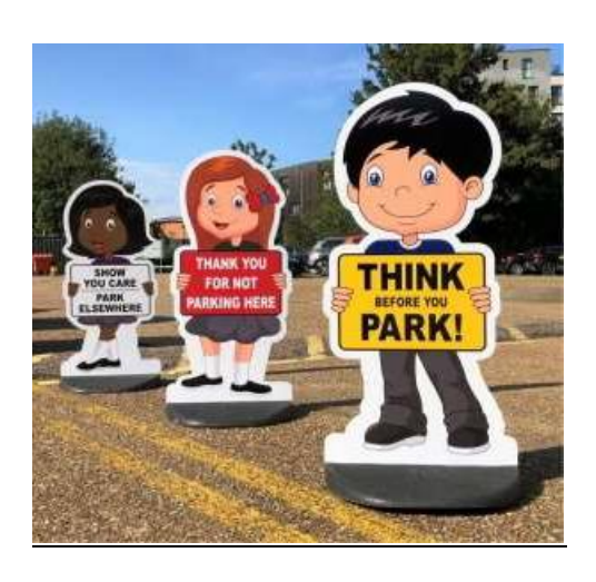
Child friendly cut out pavement signs 420 x 870mm Double sided flexible display panels Clear anti-graffiti protective face film Recycled PVC base for added stability