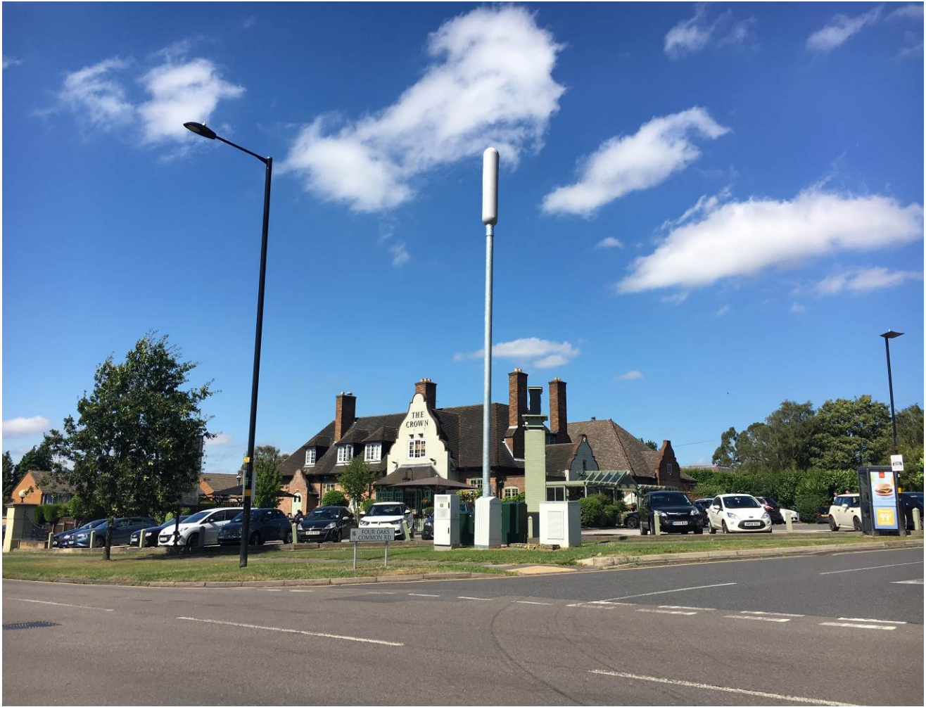
Figure 1: South facing view from corner of Crown Lane and Walsall Road