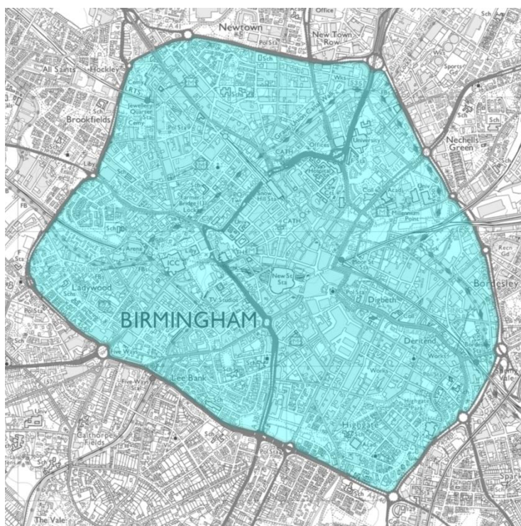
Figure 2: where we think the CAZ should be

For this, we think that the CAZ should include all the roads within the A4540 Middleway ring road. Looking at figure 1, the worst hotspots are in this area, although there are still some high levels of NO 2 on the east side of the ring road and on the motorway near Gravelly Hill Interchange (M6 junction 6, Spaghetti Junction).