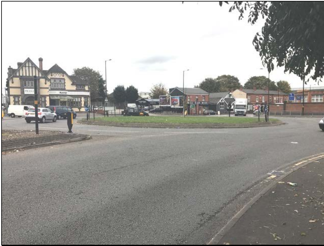
Figure 1 - View towards Warwick Road (Eastbound)