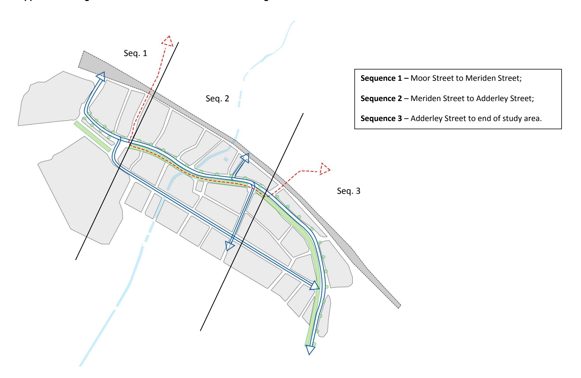
Appendix F – Digbeth Public Realm with Southern Tram Alignment