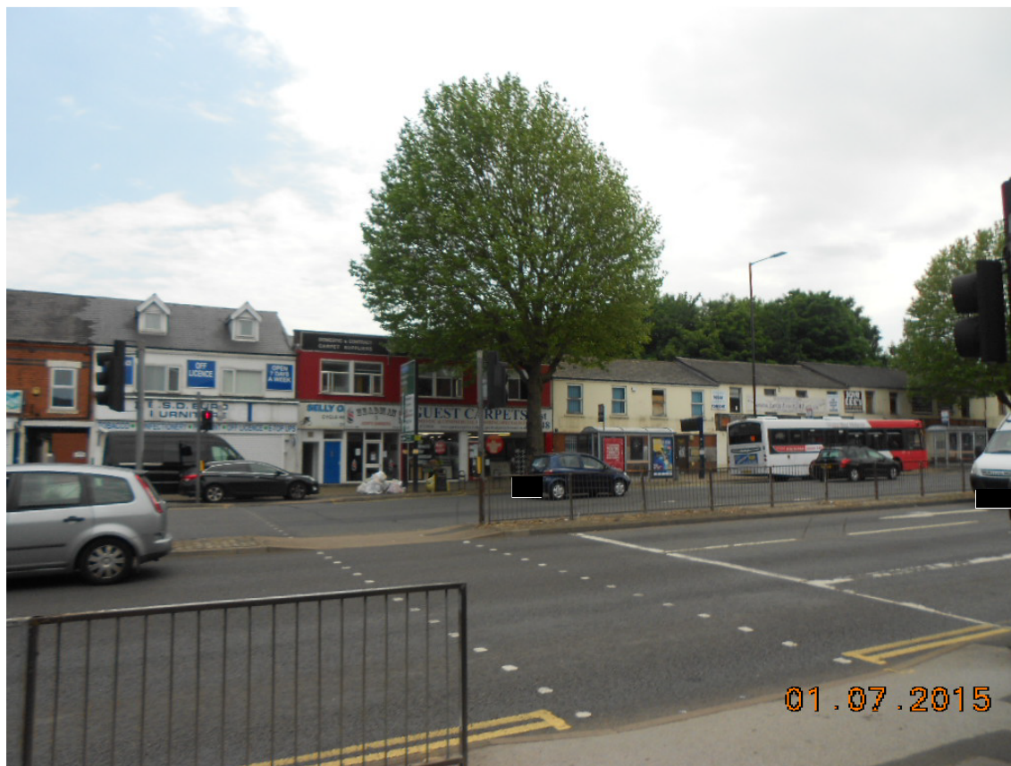
Frontage to Bristol Road