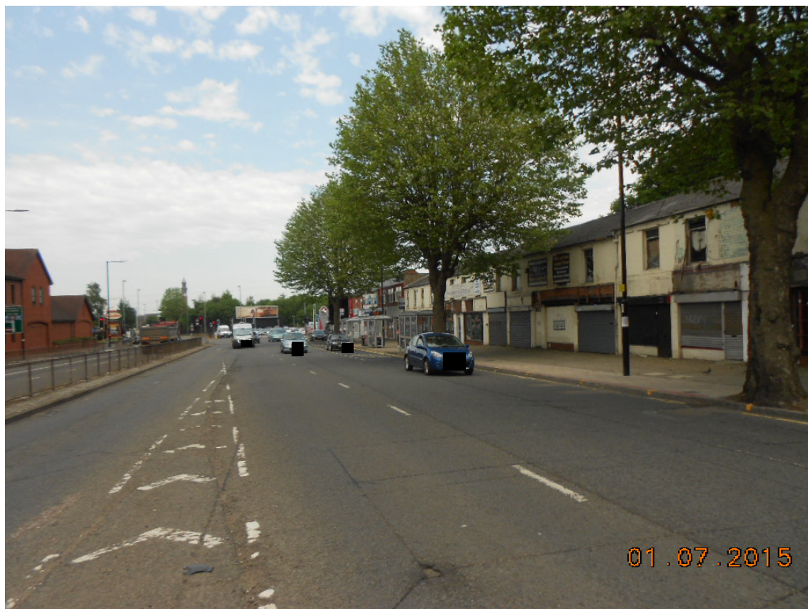
View northwards along application site (Sainsburys opposite)