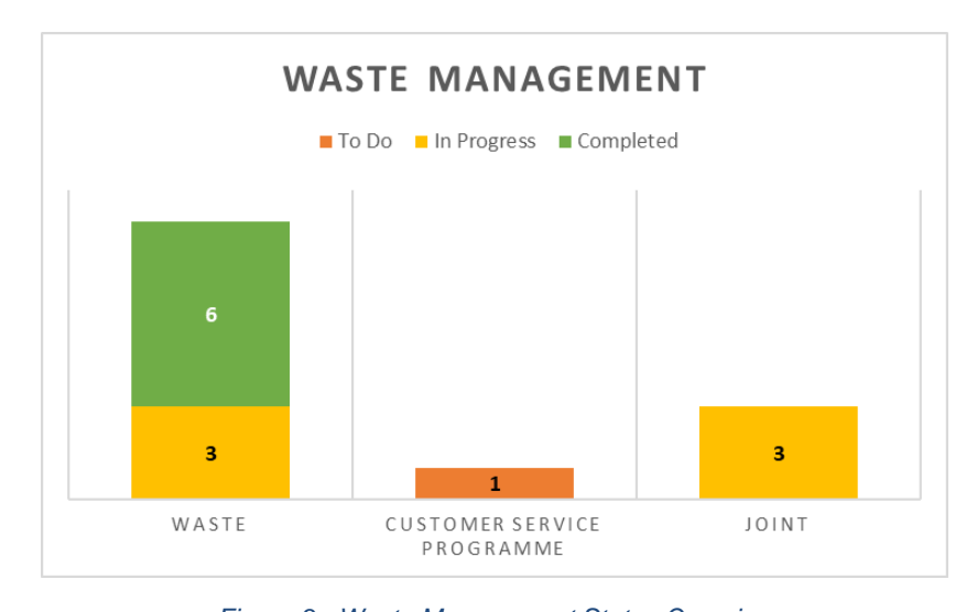
Figure 3 - Waste Management Status Overview