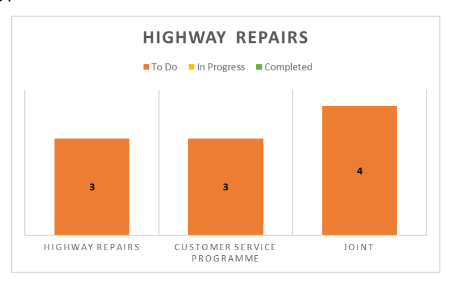
Figure 1 - Highway Repairs Status Overview