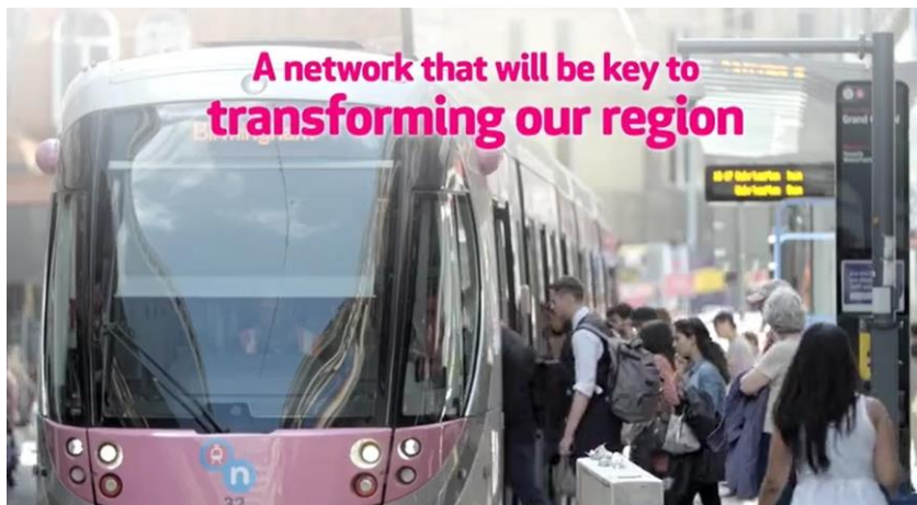
Birmingham Westside Extension Video ( https://vimeo.com/281236770 )