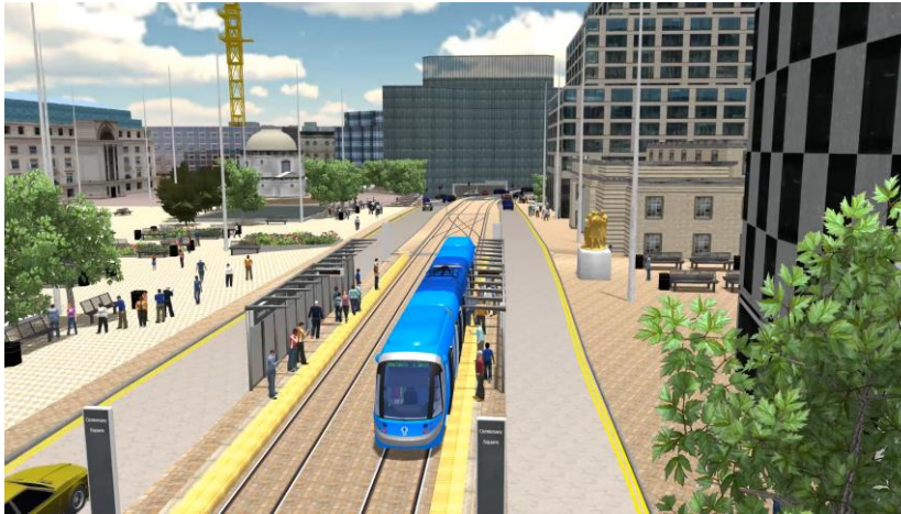
Grand Central to Centenary Square simulator footage ( https://drive.google.com/open?id=16APoV2GS4OnHmzqnzgyBnfV8Q_n26i1G )