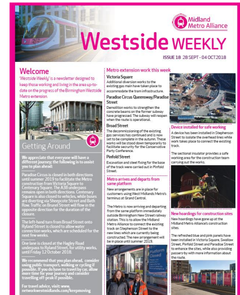
Westside Weekly newsletter (available at www.metroalliance.co.uk )