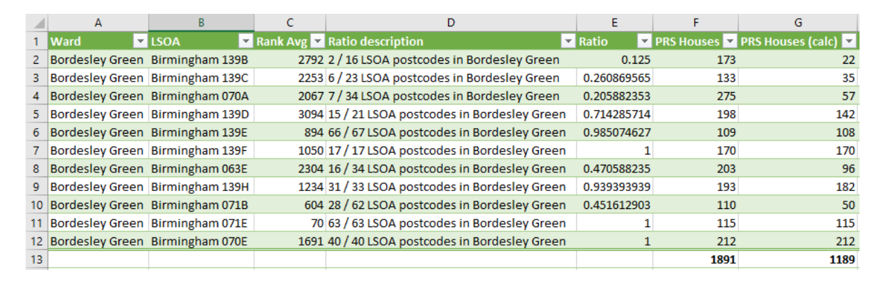
Figure 2 LSOA-Ward aggregation example for Bordesley Green ward

Using the previous methodology, the count of houses for the LSOA in line 2 of the table (Birmingham 139B) is used as a whole, and all 173 houses are included in the sum of the LSOA although only 2 out of its total 16 postcodes are located inside Bordesley Green. With the new methodology, the count of houses is calculated by multiplying the ratio (2/16 = 0.125) with the total houses of that LSOA (173) and only 22 houses of this LSOA are included in the sum of houses for Bordesley Green ward. So, the sum of houses using the new method (Column G of the table) is much lower than the sum of houses using the old method (Column F).