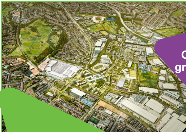
Perry Barr 2040