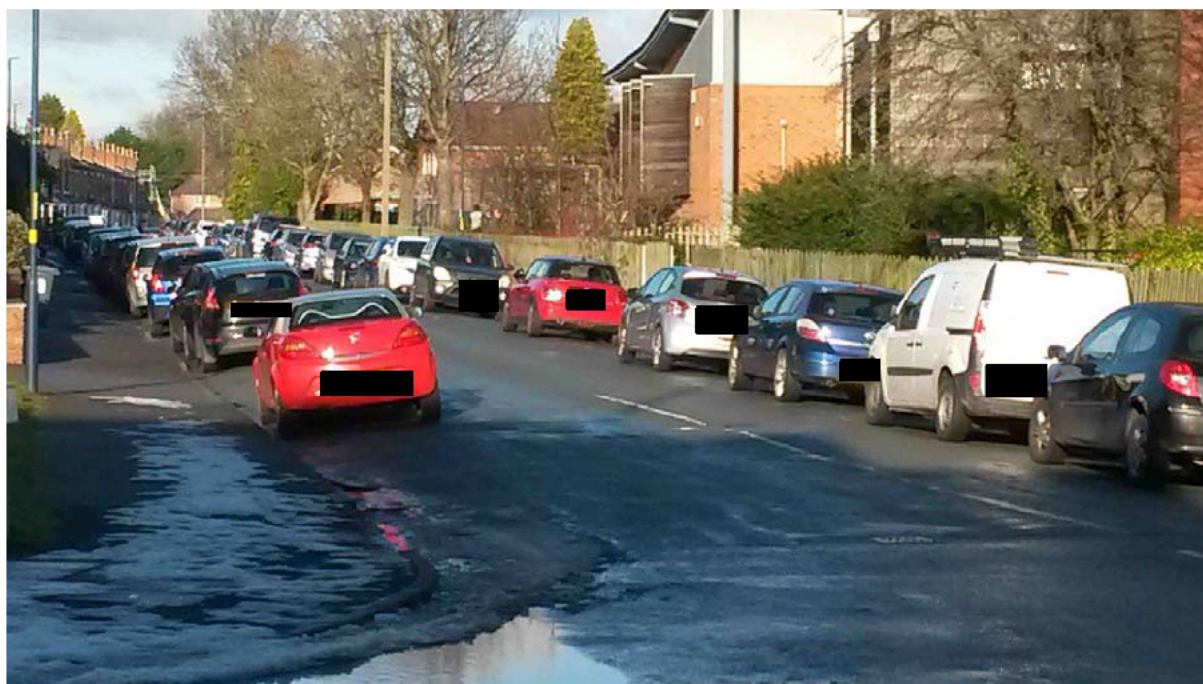
Wood Lane viewed from Court Oak Road