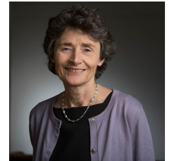
Estelle Morris Chair