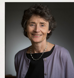
Estelle Morris Chair