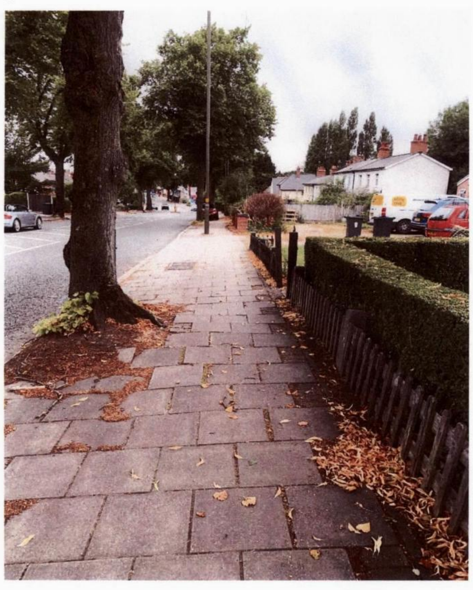
OBSERVATIONAL REPORT: Tesco Express Linden Road Birmingham B30 1PA.