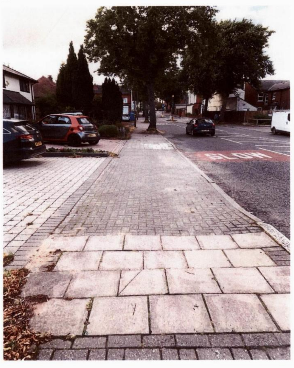
OBSERVATIONAL REPORT: Tesco Express Linden Road Birmingham B30 1PA.