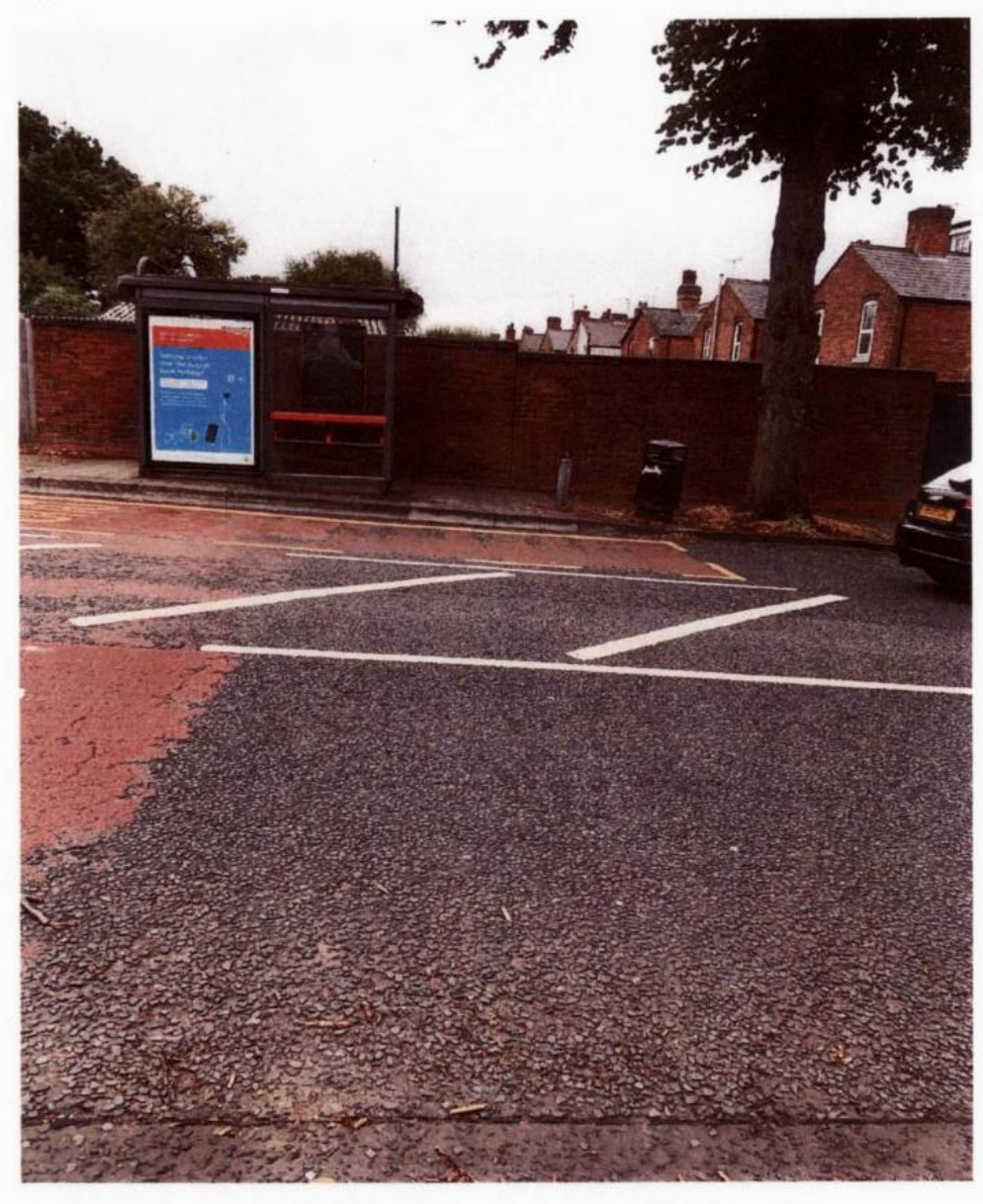
OBSERVATIONAL REPORT: Tesco Express Linden Road Birmingham B30 1PA.