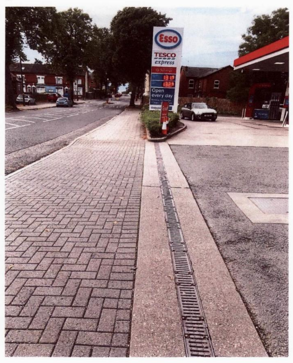
OBSERVATIONAL REPORT: Tesco Express Linden Road Birmingham B30 1PA.