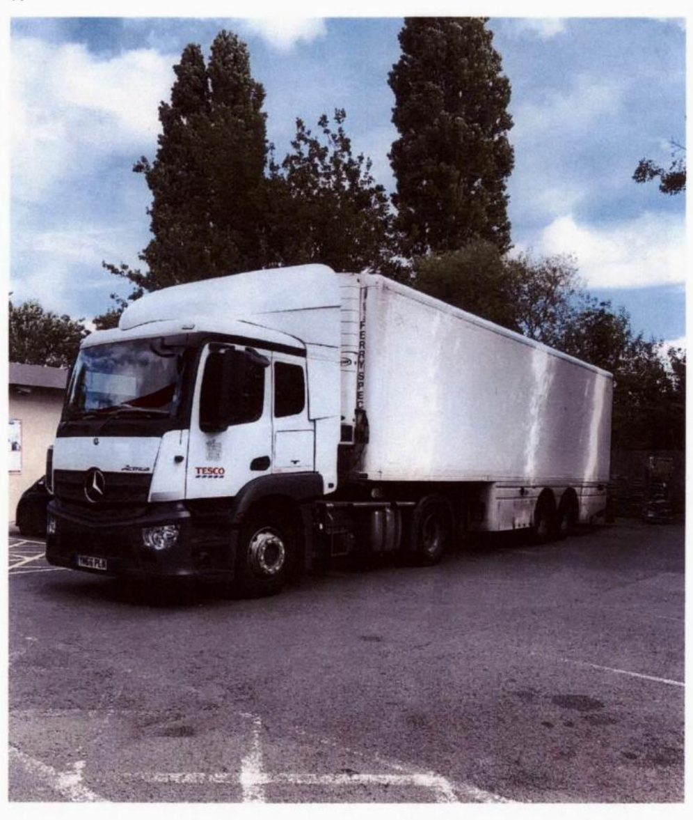
OBSERVATIONAL REPORT: Tesco Express Linden Road Birmingham B30 1PA.