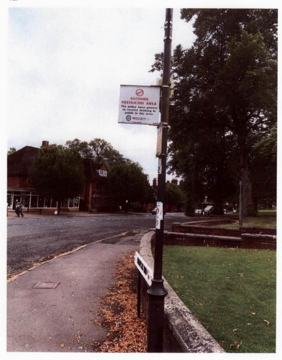
OBSERVATIONAL REPORT: Tesco Express Linden Road Birmingham B30 1PA.