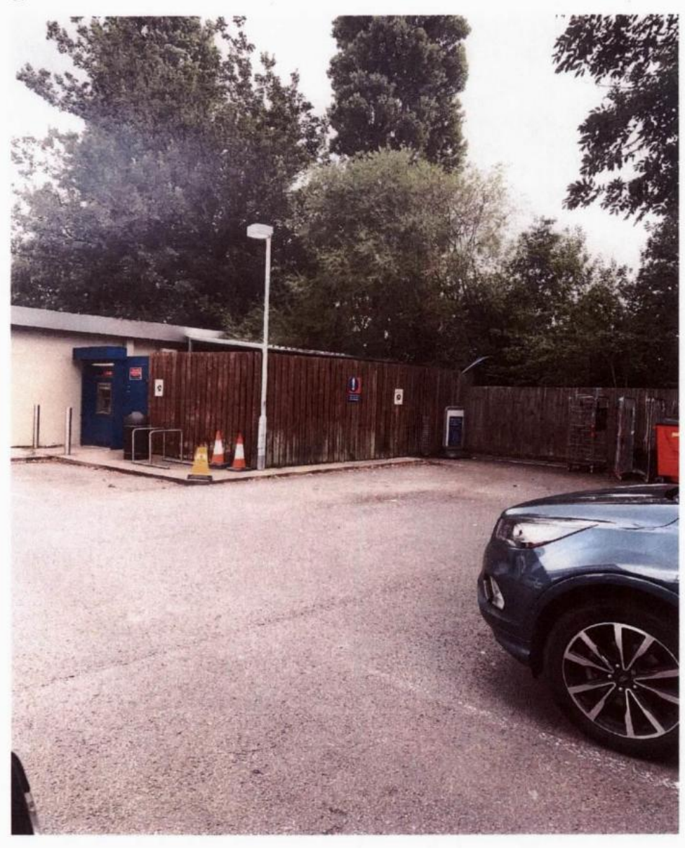
OBSERVATIONAL REPORT: Tesco Express Linden Road Birmingham B30 1PA.