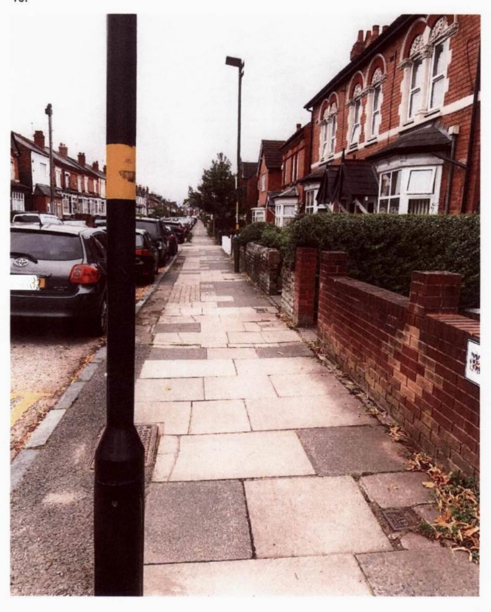
OBSERVATIONAL REPORT: Tesco Express Linden Road Birmingham B30 1PA.