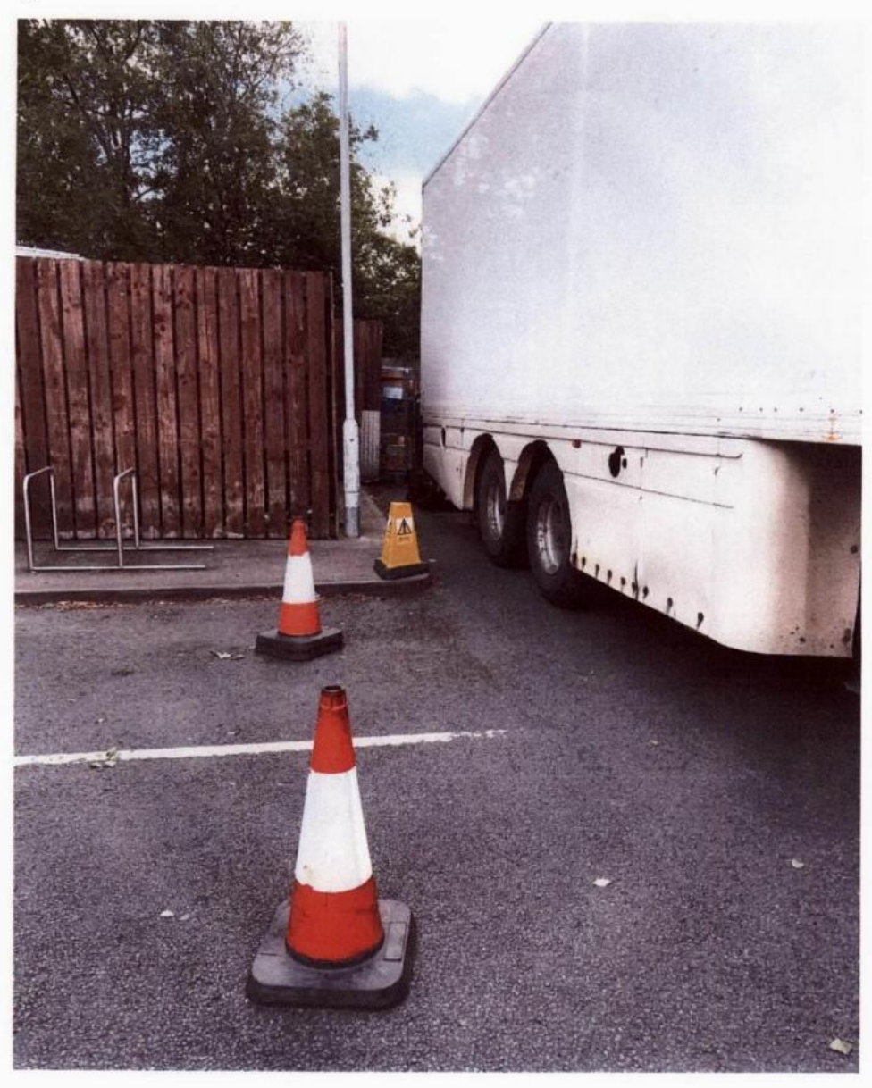
OBSERVATIONAL REPORT: Tesco Express Linden Road Birmingham B30 1PA.