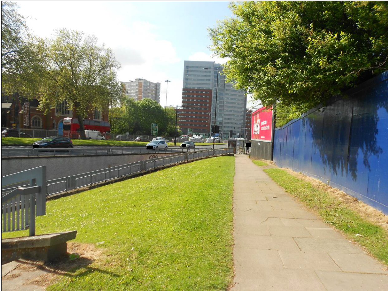
Figure 1: View of site frontage to Bristol Street