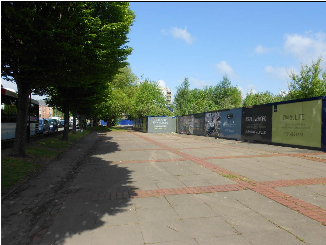
Figure 2: View of site frontage to Lee Bank Middleway