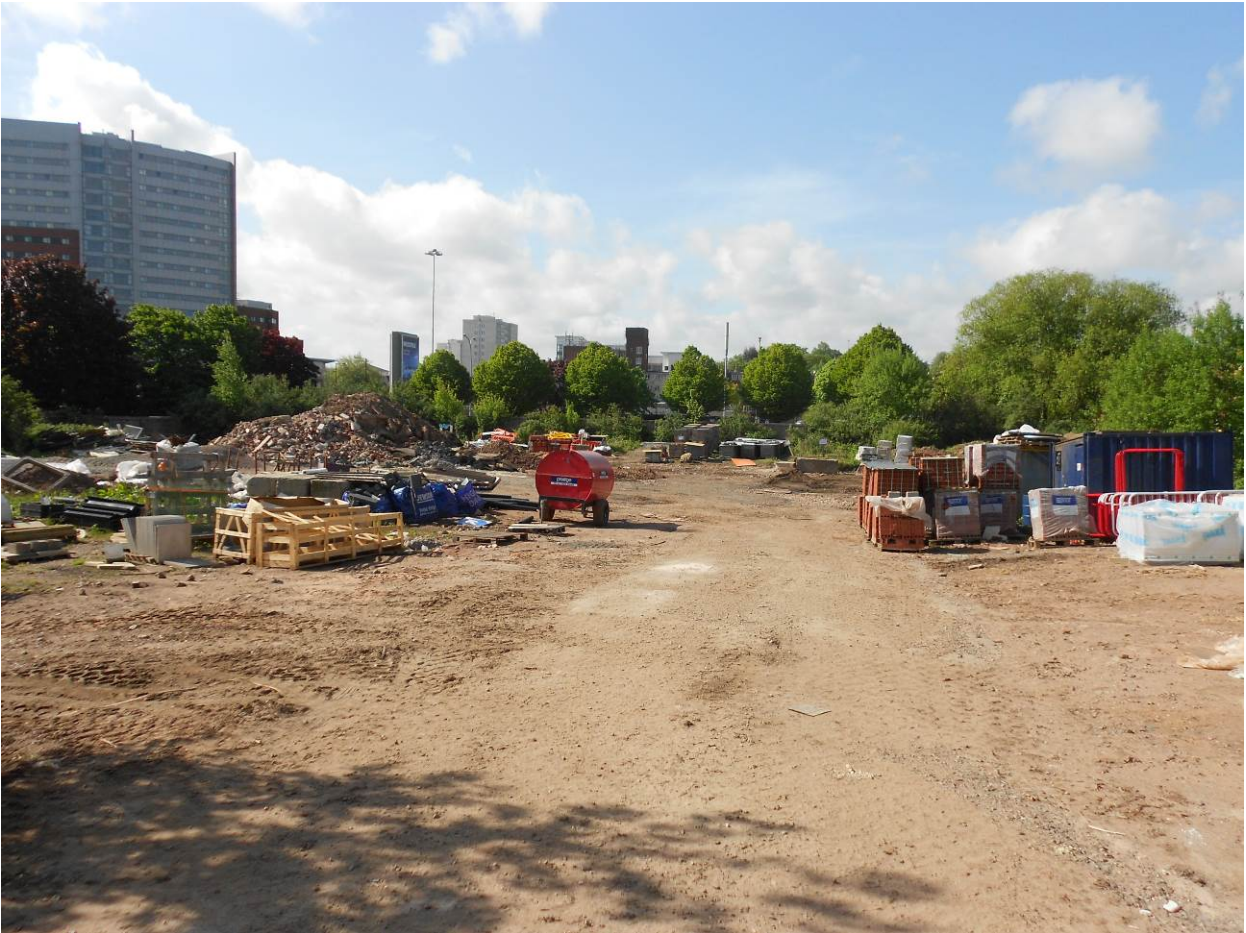
Figure 4: Internal view of site