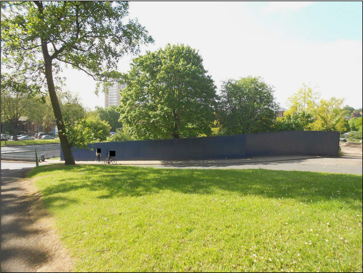
Figure 3: View of site frontage to Rickman Drive