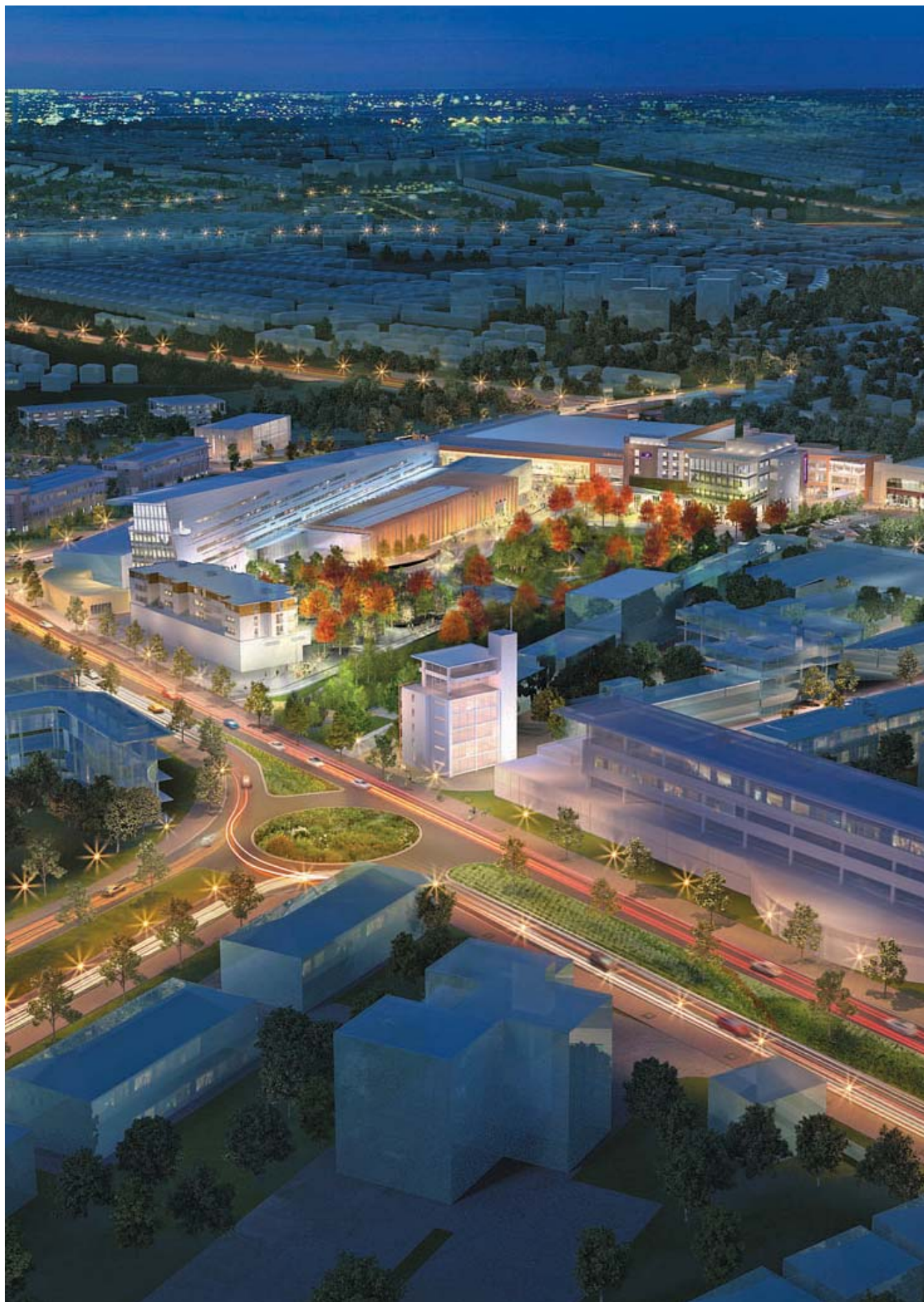
Longbridge District Centre