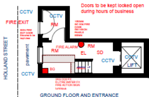
GROUND FLOOR AND ENTRANCE

LICENSING FIRST FLOOR 123 PARADE SUTTON COLDFIELD B72 1PU SCALE 1 100 FEBRUARY 2020