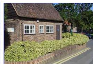
Euonymus Emerald n Gold