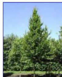
Carpinus betulus 'Frans Fontaine'