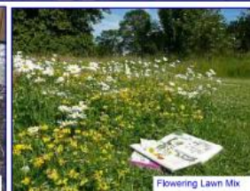
Flowering Lawn Mix