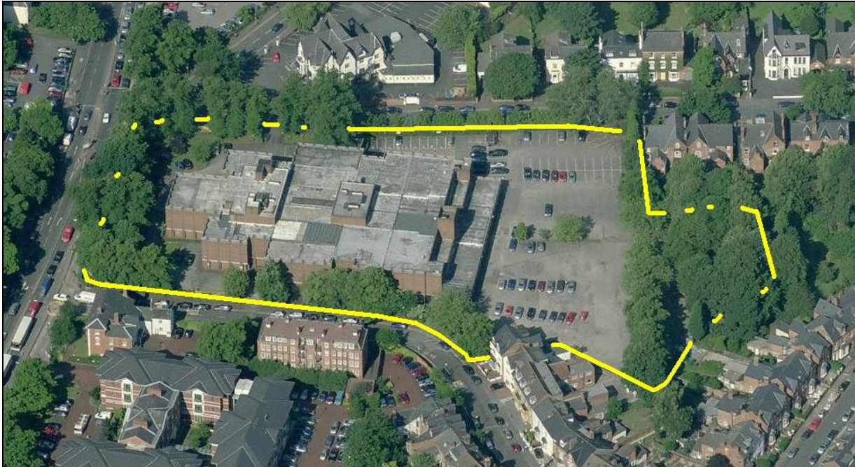
Aerial view looking west