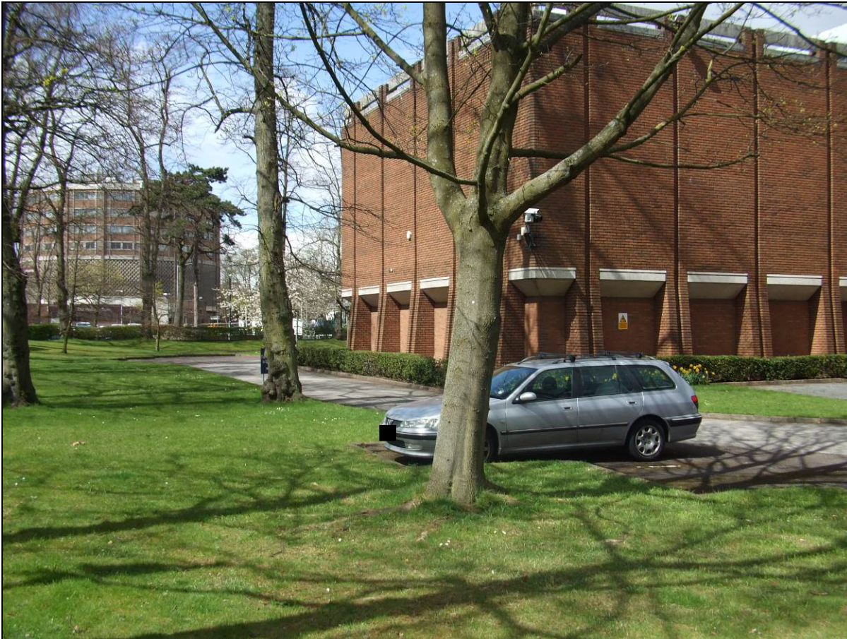
Front view of site looking north