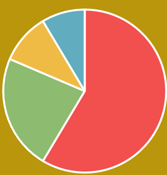
Expected Revenue Growth