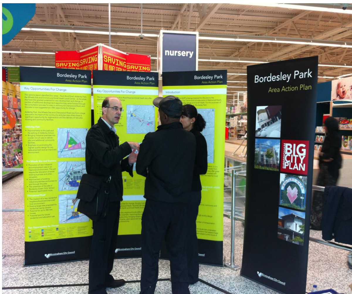
Bordesley Park AAP Preferred Options consultation event: Asda Small Heath