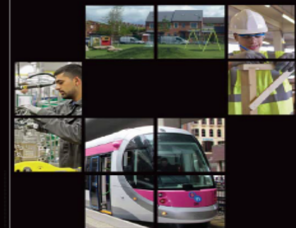
Bordesley Park Area Action Plan Pre-Submission Report

This version of the Plan follows the Options Report (2011) and Preferred Options (2013) and has been informed by comments received in previous rounds of consultation as well as further technical work.