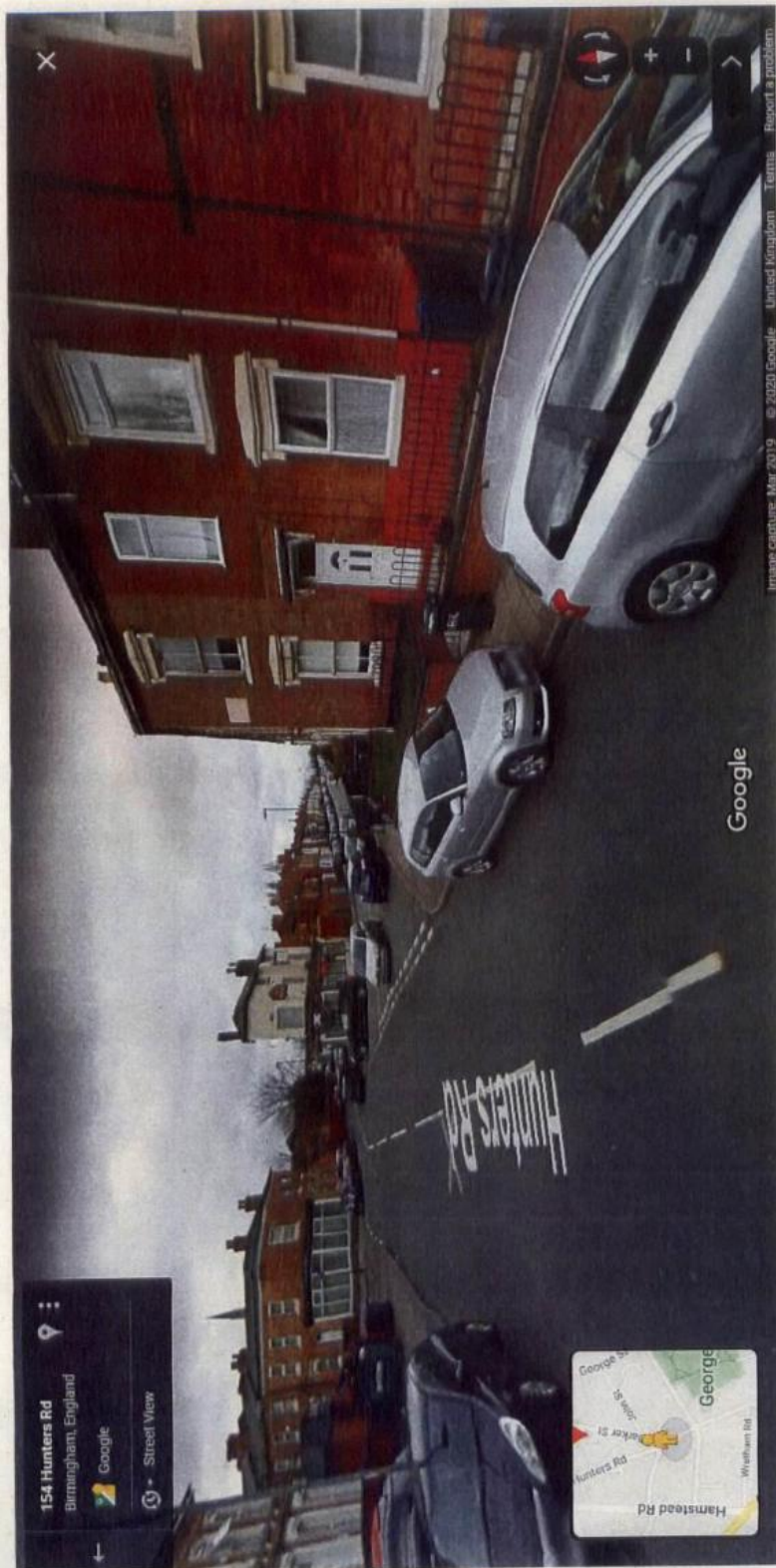
Street view of the premises and surrounding area