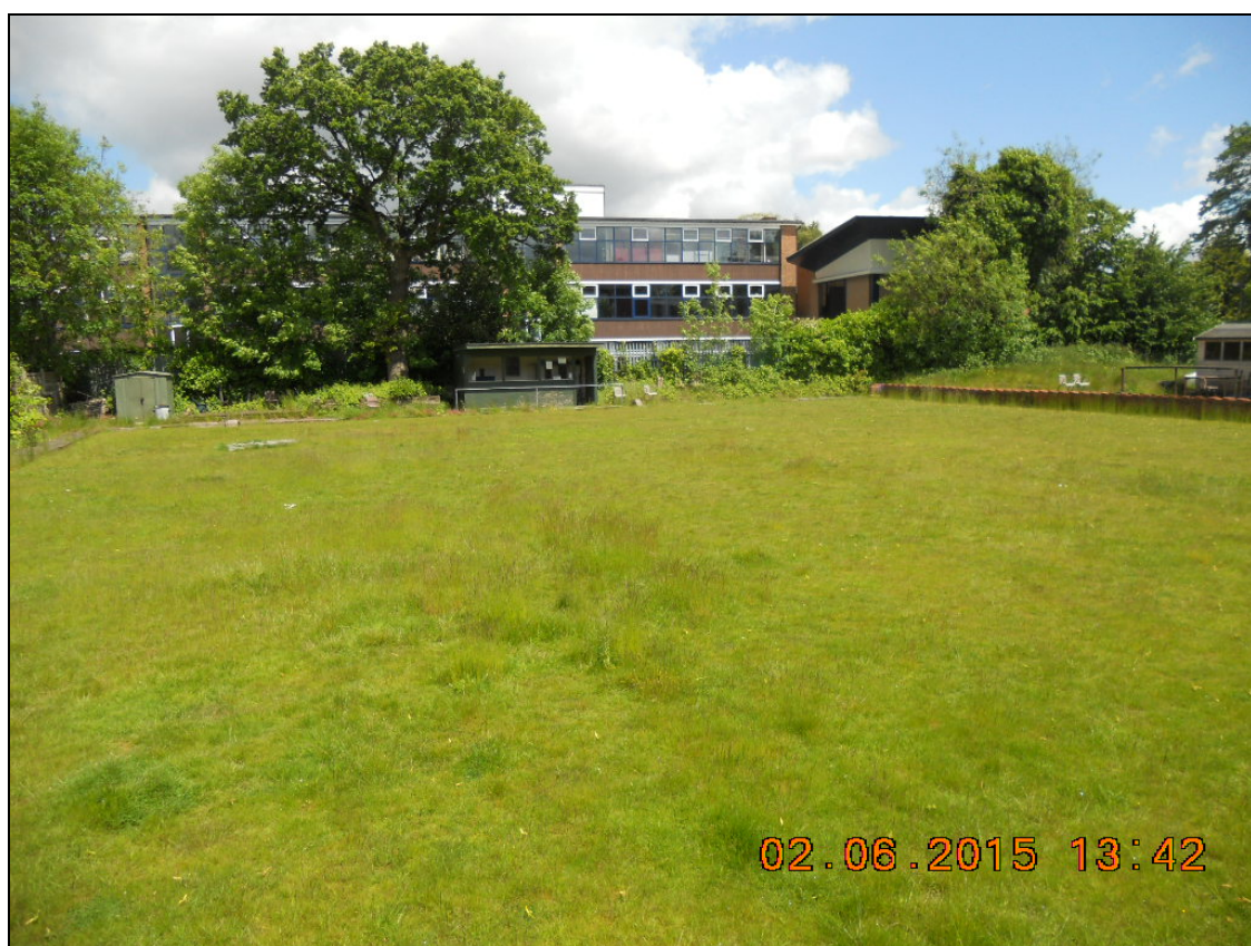
Figure 2 – existing bowling green