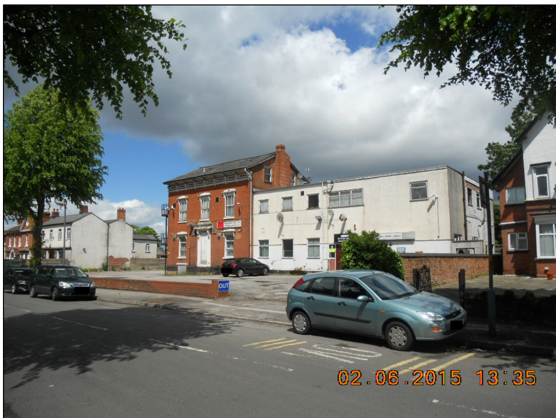
Figure 1 – Botteville Road frontage