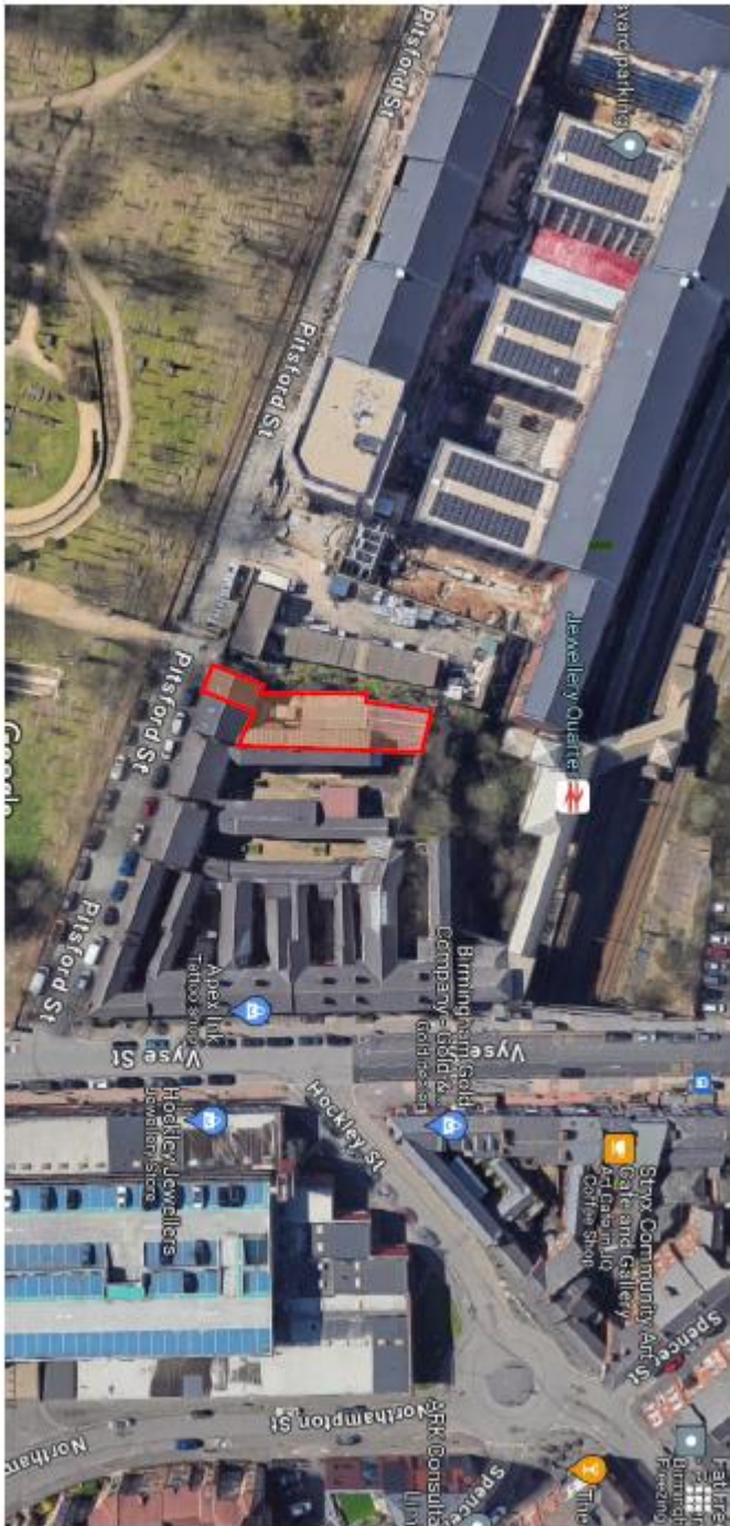
APPENDIX 1 – LOCATION OF JEWELS LOUNGE