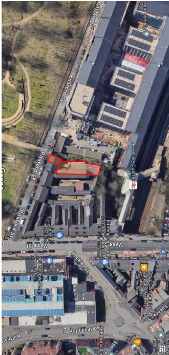
APPENDIX 1 – LOCATION OF JEWELS LOUNGE