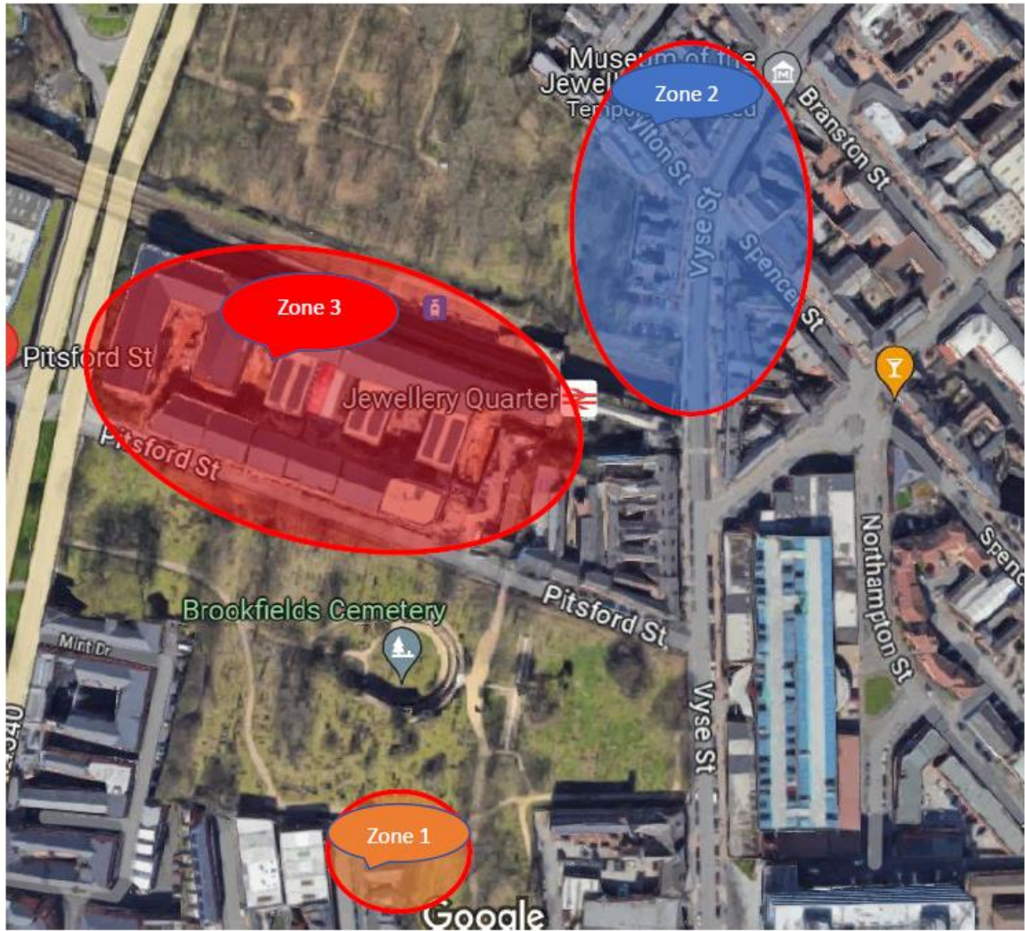
APPENDIX 2 – ZONES OF NOISE COMPLAINT