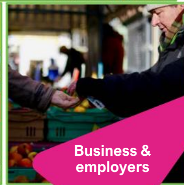
Business & employers