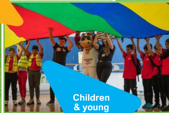
Children & young people