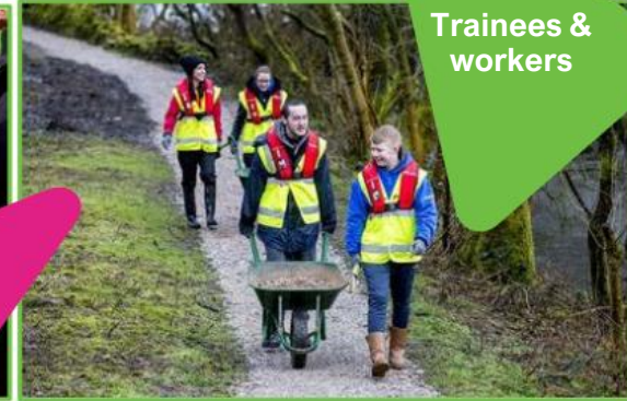
Trainees & workers