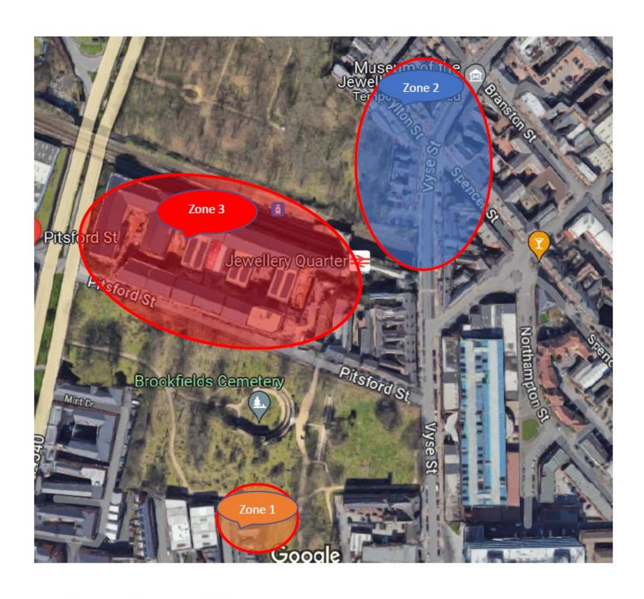
APPENDIX 2 – ZONES OF NOISE COMPLAINT