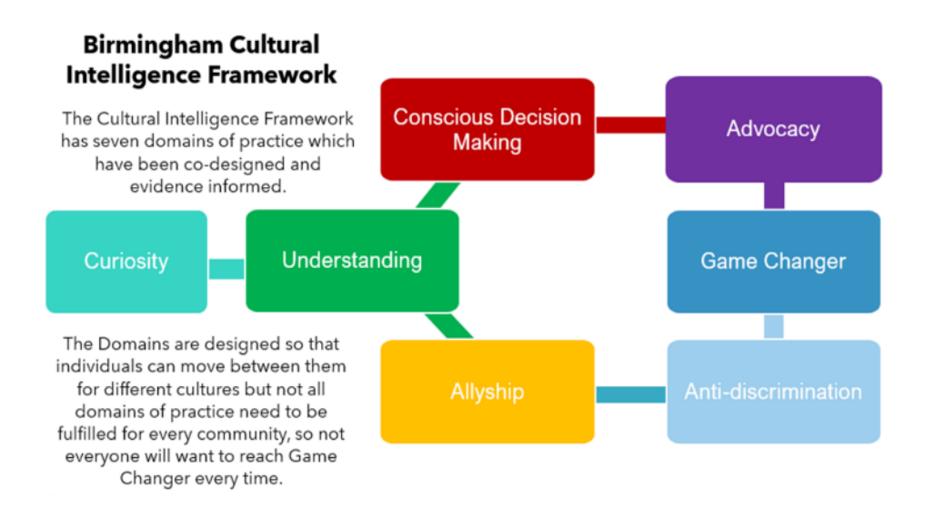
Figure 2 1: The Birmingham City Council Cultural Intelligence Framework

The BCIF has been tested out with public sector staff though a programme of workshops throughout October and November 2023.