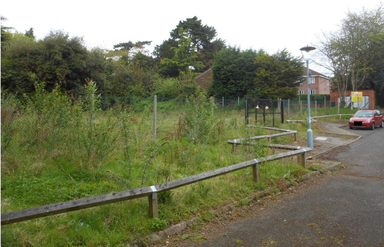
Photograph 1: Front of application site