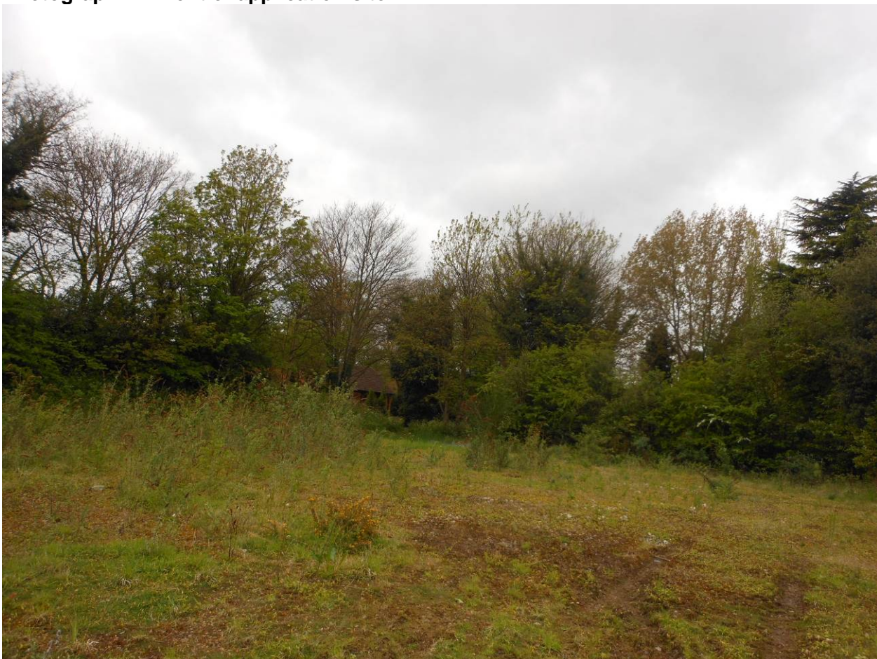
Photograph 2: View of Southwest corner of application site